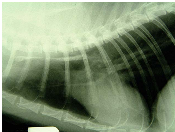
Fig 1. Right lateral thoracic radiograph from case 4, taken after fluoroscopic study. Barium is retained in the cranial thoracic oesophagus, to the level of the heart base.

In 2/4 cases, preliminary laboratory diagnostic investigations were performed, which included haematological and serum biochemical analysis, and testing for feline leukaemia virus (FeLV) antigen and feline immunodeficiency virus (FIV) antibody. Results were normal in all cats. Lateral plain thoracic radiography was also normal in all cases. Diagnostic imaging studies included a barium meal under fluoroscopic observation ( n = 2 ), a barium meal with subsequent radiography ( n = 1 ; case 3), and a barium meal with combined fluoroscopy and radiography ( n = 1 ; case 4; Fig 1). Retention of barium was demonstrated cranial to a narrowing at the thoracic inlet